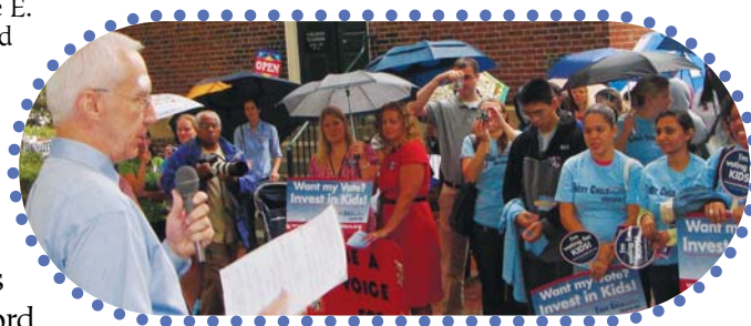
"Step Up for Kids" rally at Capitol Square.

The fiscal year for Voices for Virginia's Children was from January 1, 2007 through December 31, 2007. This 2007 Annual Report is produced to record all grants and gifts received in this fiscal year. Every effort has been made to ensure accuracy of these listings. If you were a contributor and your name was omitted, listed incorrectly, or misspelled, please notify Voices. Thank you.